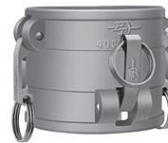
CXC Coupler X Coupler