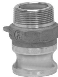
Part F Male Adaptor X Male Thread