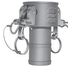
Positive Locking Safety Coupler