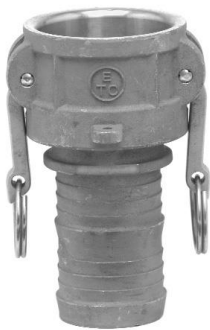
Part C Female Coupler X Hose Shank