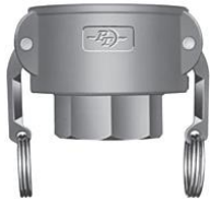
D-Reducer Coupler X Female NPT Thread