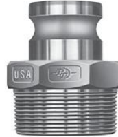
F-Reducer Adaptor X Male NPT Thread