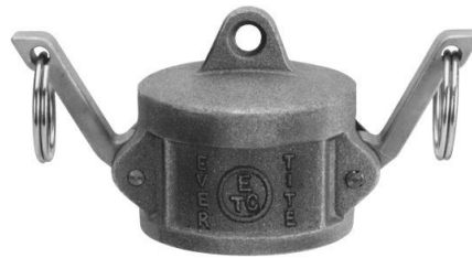
Part DC Dust Cap