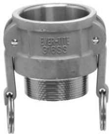
Part B Female Coupler X Male Thread