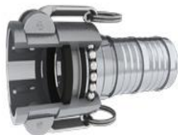
Swivel Cam and Groove