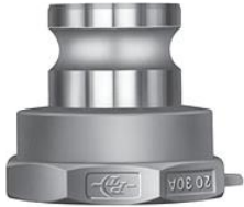
A-Reducer Adaptor X Female NPT Thread