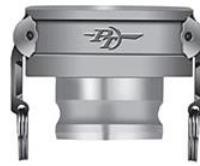
CXA Short Reducer Coupler X Adaptor