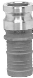
Part E Male Adaptor X Hose Shank