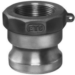
Part A Male Adaptor X Female Thread