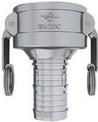
C-Reducer Coupler X Hose Shank