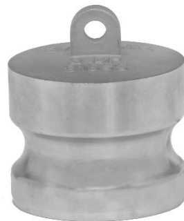
Part DP Dust Plug

Available in 1/2"-8" sizes. Available in Aluminum, Brass, Stainless Steel, Ductile Iron, Polypropylene, Nylon, and other alloys upon request.