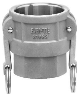
Part D Female Coupler X Female Thread