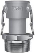
B-Reducer Coupler X Male NPT Thread